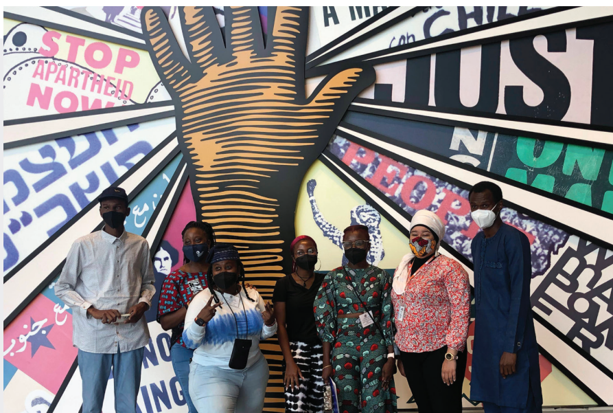
GCIV was one of the selected hosts for the first in-person IVLP since early 2020. The Nigerian visitors pictured at the National Center for Civil and Human Rights.