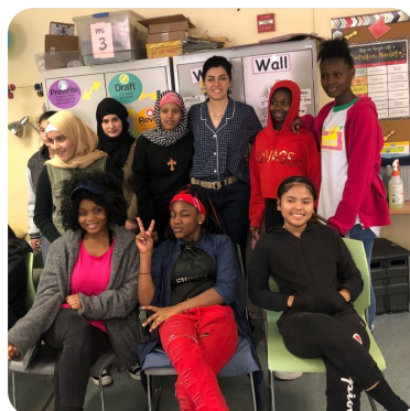
International Woman of Courage Awardee at Global Village Project