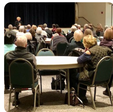
Great Decisions 2020