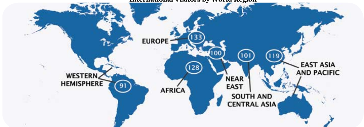
International Visitors by World Region