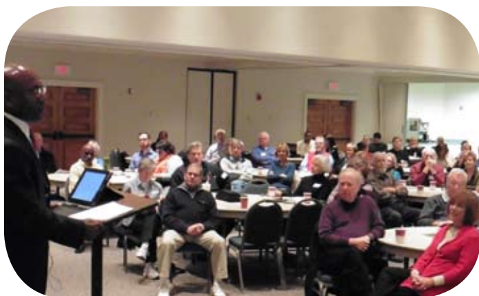
Nearly 350 people participate in the GCIV Great Decisions Foreign Policy Lecture Series hosted by the Dunwoody United Methodist Church.

GCIV serves as the state coordinator for the Foreign Policy Association (FPA)'s Great Decisions program. In this role, GCIV helps coordinate discussion groups and lecture series that give participants the opportunity to expand their understanding of world affairs. Topics change annually and are based on the FPA's non-partisan briefing book. Nearly 350 people participated in the 2019 GCIV Foreign Policy Lecture Series. In addition, there were approximately 20 discussion groups across the state.