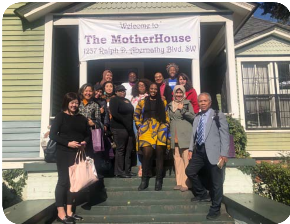
Representatives from SisterLove, Inc. discuss healthy love and breaking the stigma against HIV/AIDS with Indonesian pluralism activists.