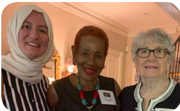
2019-20 International Women Associates (IWA) members.

In addition to assisting with the International Visitor Leadership Program (IVLP), we encourage interns to attend GCIV community programs to further their exposure to Atlanta's international sector. This year GCIV trained two interns from Georgia State University and Clemson University.