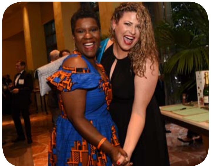
Dance the night away at the International Consular Ball.