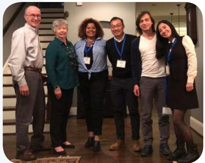
Fulbright scholars from across the world dine with GCIV volunteer hosts.