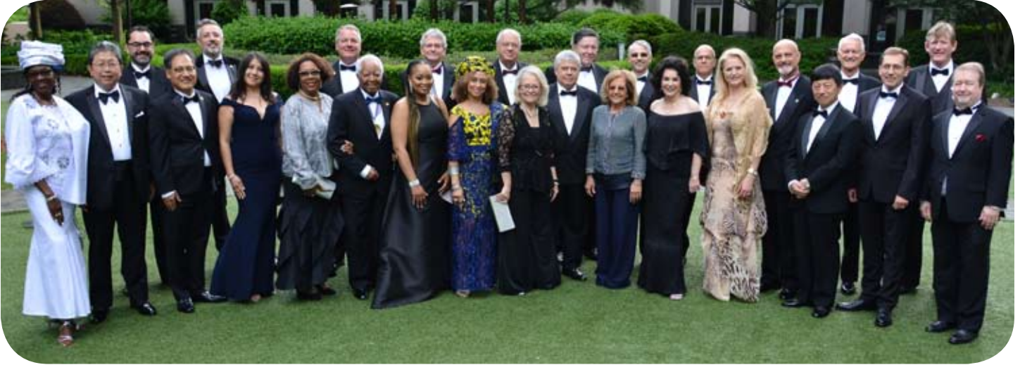
Members of the Georgia Consular Corps at GCIV's International Consular Ball.

GCIV's International Consular Ball continues to be Atlanta's premier international event. Atlanta's business and civic leaders hosted the Georgia Consular Corps at the InterContinental Buckhead Hotel for the 38th annual International Consular Ball on Saturday, May 11, 2019. GCIV hosts the annual gala to honor the men and women serving as consular representatives in Georgia.