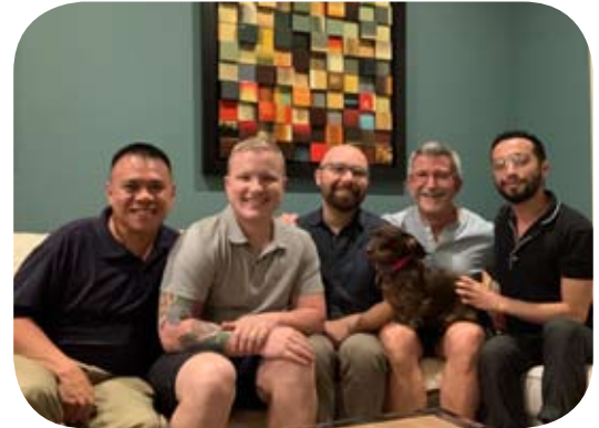
Mexican IVLP alumnus enjoys dinner hospitality during a follow-up visit focused on LGBT Rights in the U.S.