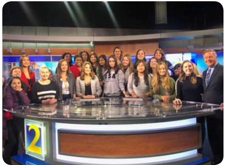
The Women's Empowerment Through Sports Journalism group at WSB-TV Atlanta.

GCIV had the honor of hosting half this group. While in Georgia, the participants met with their counterparts at CNN International, Atlanta United, WSB-TV and spent a day at the James M. Cox Jr. Center for International Mass Communication Training and Research, part of the Grady College of Journalism and Mass Communication at the University of Georgia.