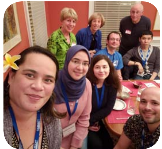
Fulbright scholars delight in dinner hospitality with GCIV volunteer hosts.