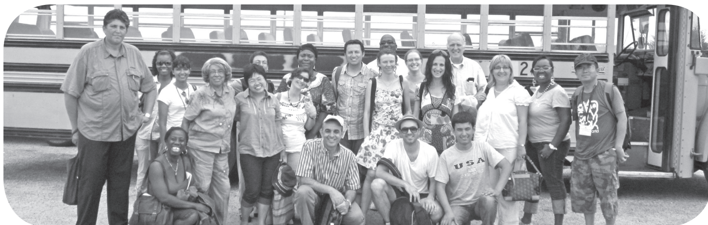
18 architects, archaeologists, curators and cultural preservation specialists from around the world visit Sapelo Island near Savannah, Georgia.