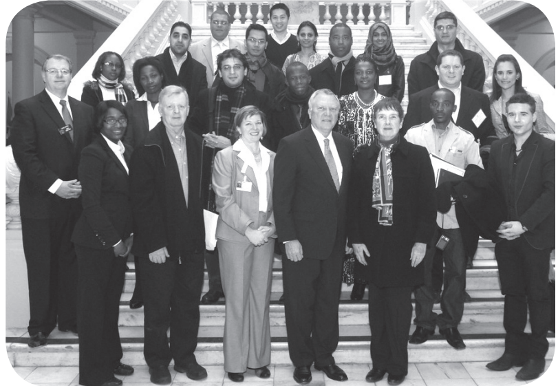
A world-wide delegation of 17 NGO representatives and government officials with Governor Nathan Deal at the Georgia State Capitol.

GCIV administers the U.S. Department of State’s International Visitor Leadership Program (IVLP) in the state of Georgia. Launched in 1940, the IVLP seeks to build mutual understanding between the United States and other nations through carefully designed professional visits to the U.S. for current and emerging foreign leaders. U.S. ambassadors consistently rank the IVLP as most effective in a long list of public diplomacy tools at their disposal. GCIV is one of 94 community-based organizations around the country that implement this impressive program on behalf of the U.S. government. In 2001 the national network, National Council for International Visitors (NCIV), was nominated for the Nobel Peace Prize for its efforts to foster international understanding.