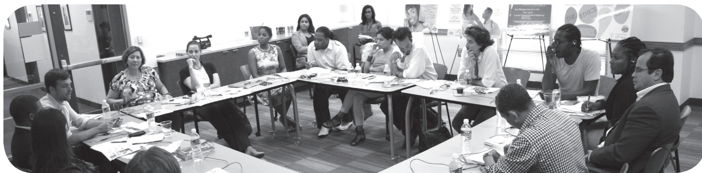
Emory Ethics Center leaders and their community partners with artists and arts advocates from Colombia to discuss the arts.