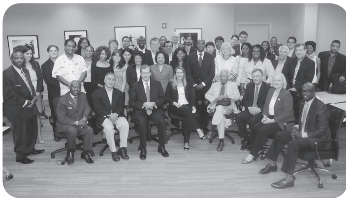
Atlanta City Council's Advisory Committee on International Relations (ACIR) with members of the Consular Corps and GCIV Envoys.