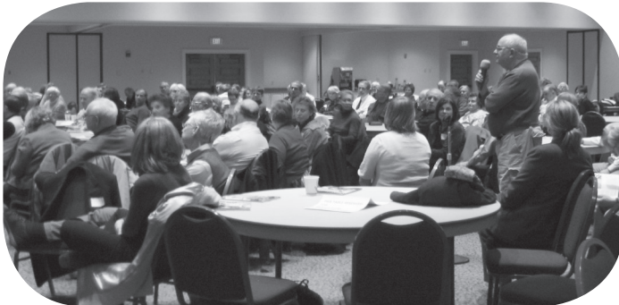
Nearly 300 people participate in the GCIV Great Decisions Foreign Policy Lecture Series hosted by the Dunwoody United Methodist Church.