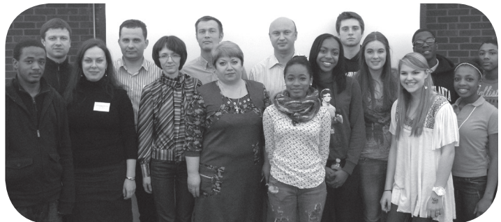
Russian government officials with students from North Atlanta High School.

Schools that participated in the FY 2011 program include Amana Academy, Atlanta International School, International Community School, Lovett School, Mohammed Schools and elementary, middle and high schools in Atlanta Public Schools, DeKalb County Schools and Gainesville City Schools. These schools hosted 121 visitors from 39 different countries including Afghanistan, Angola, Australia,