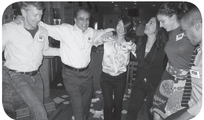
GCIV members and CNN Journalism Fellows perform a traditional Greek dance at Taverna Plaka.

GCIV's work to build international understanding and cooperation. GCIV extends special thanks to the corporate partners and patrons for their support of GCIV's citizen diplomacy work and the 30th annual International Consular Ball.