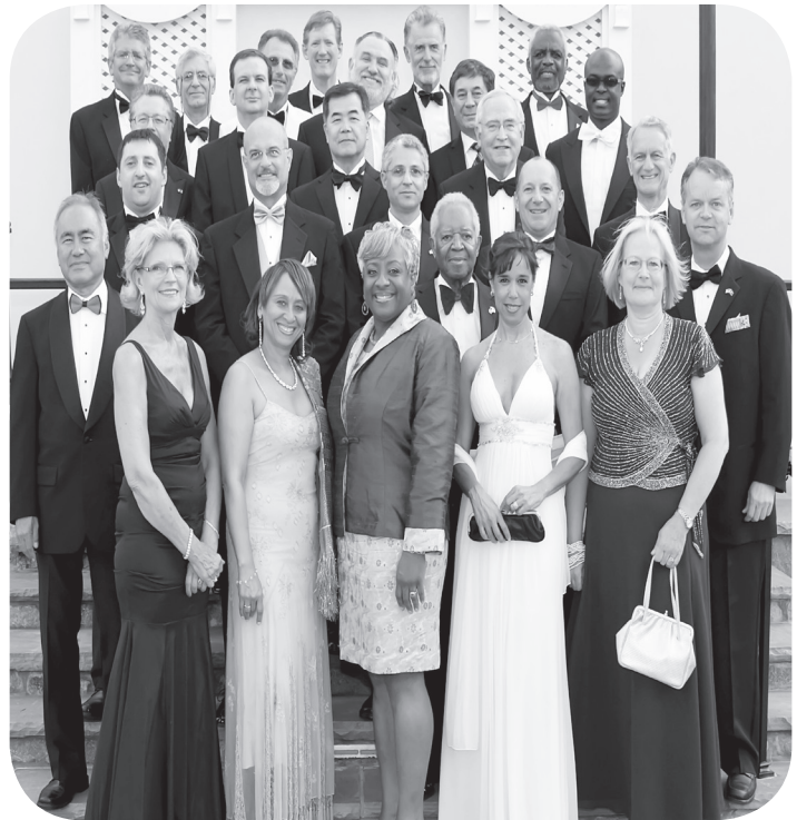
Members of the Consular Corps at GCIV's International Consular Ball.

International Dining Experiences give members the chance to meet visiting delegations in a more informal, social environment. IDEs take place at a different ethnic restaurant around the 15th of every other month. Members are encouraged to bring friends and neighbors as an introduction to GCIV. Many of our hosts enjoy this opportunity to meet other members while sampling exotic cuisines. In FY 2011, GCIV organized six IDEs involving over 200 hundred guests. GCIV also hosted world-wide delegations of CNN Journalism Fellows at half of the IDEs. Restaurants included Anis Bistro, Cafe Bombay Indian Bistro, Nakato Japanese Restaurant, Penang Malaysian Restaurant, Pizzeria Venti and Taverna Plaka.